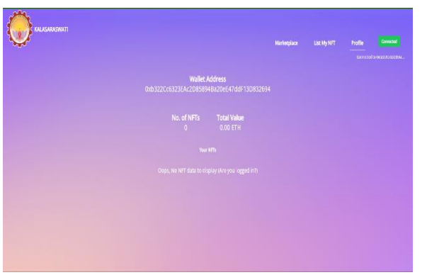
fig. 2:User profile with connected metamask wallet

The fig.2 appears to be a user's profile page on a platform called Kalasaraswati, displays users's connected wallet address, The profile also shows that the user currently has 0 NFTs (Non-Fungible Tokens) and a total value of 0.00 ETH (Ethereum):