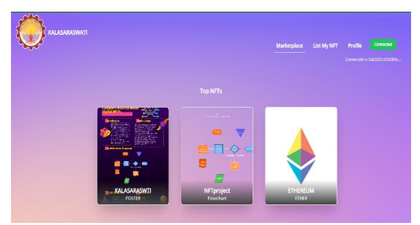
fig. 1:NFT marketplace UI

As was previously said, NFT Marketplace is a platform that will allow NFT producers and others to browse and exchange these exclusive digital products..Typically, a scripting language like ReactJs is used to develop the front end. Fig.1 image shows UI of NFT marketplace with metamask wallet connected: