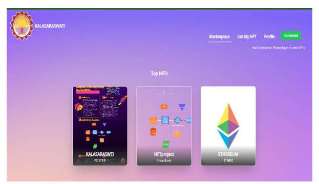
fig. 4:NFT marketplace

Fig.4 image shows the "Top NFTs" section of the Kalasaraswati platform and shows listed NFTs in marketplace: